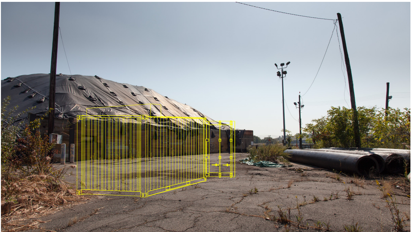
Most likely site, looking out over Arthur Kill